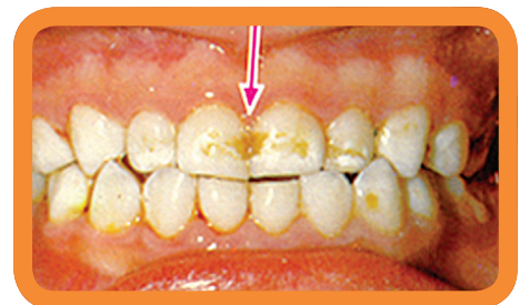
Brown spots that don't rub off.