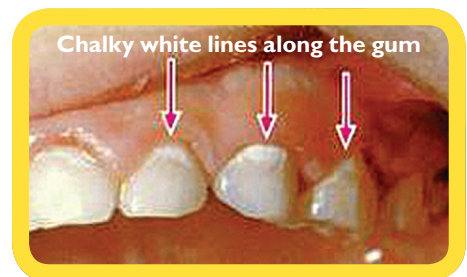
Early signs of decay.