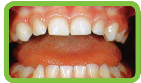
Healthy mouth and gums.

OHST-IFS-044-v2 July 2013 Original concept developed by SA Dental Service.