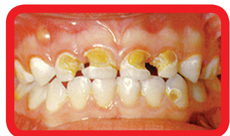
Advanced decay and infection. URGENT TREATMENT NEEDED