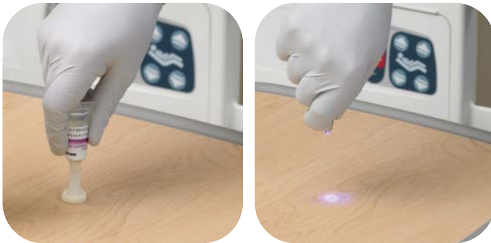
Figure 2: Examples of a fluorescent marker

Note: Pictures of the DAZO® Fluorescent Marking Gel and UV Light pen are used with permission from Ecolab®