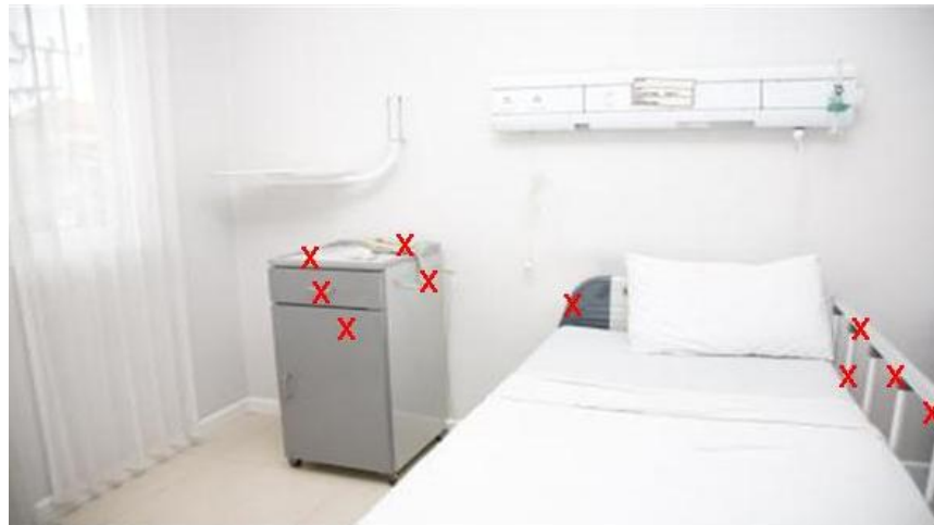
Figure 2: Frequently touched objects in the patient environment

Published studies demonstrating the importance of cleaning in outbreak scenarios underscore the likely role that environmental contamination plays in the transmission of HAIs (23). Multiple studies have shown that enhanced cleaning significantly decreases environmental contamination by a range of HAI pathogens (21, 24-27). These studies, alongside the known role of colonisation pressure, demonstrate the potentially important role that the environment plays in infection transmission and prevention.