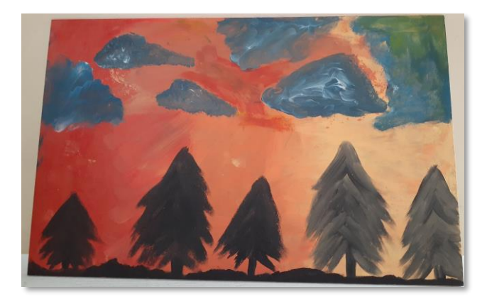
Painting by Skye (Free2Be Girls member) of the sunset

Healthy Tasmania worked with <u>Relationships</u> <u>Australia Tasmania</u> to fund a range of community initiatives to encourage social connection. Entrants received between $500 and $5 000 grants to address loneliness and connect their communities in creative ways.