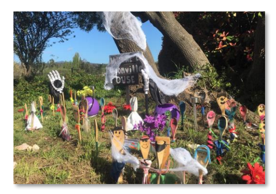
Spoonville village Ouse ready for Halloween

The Health Action Team Central Highlands started the first Spoonville village in Tasmania and encouraged local families to add to the village as a way to connect and get crafty during lockdown. They also initiated a snail mail buddy project, with children from Westerway and Ouse schools getting involved in writing to more isolated members of their communities. Since lockdown they have connected people through COVID safe interactive workshops such as Kokedama making.